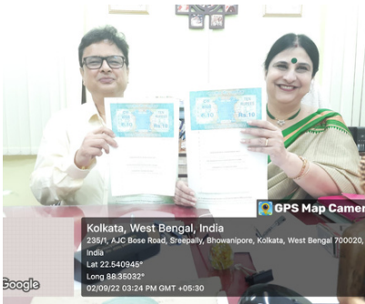
MOU between The Bhawanipur College and Deshbandhu College for Girls