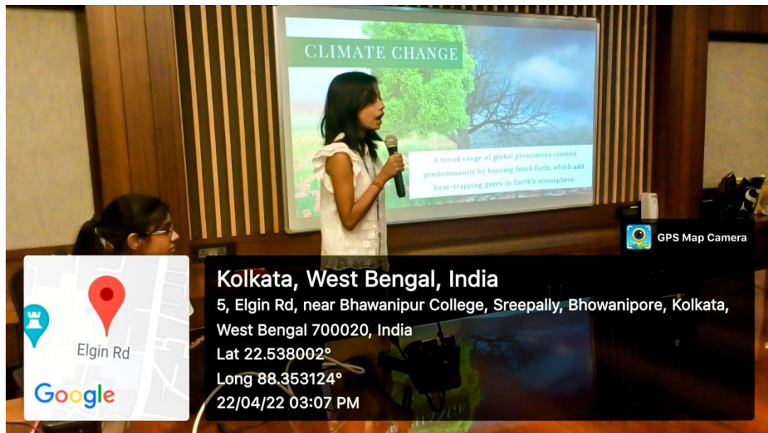
Participant of the Earth Day, 2022