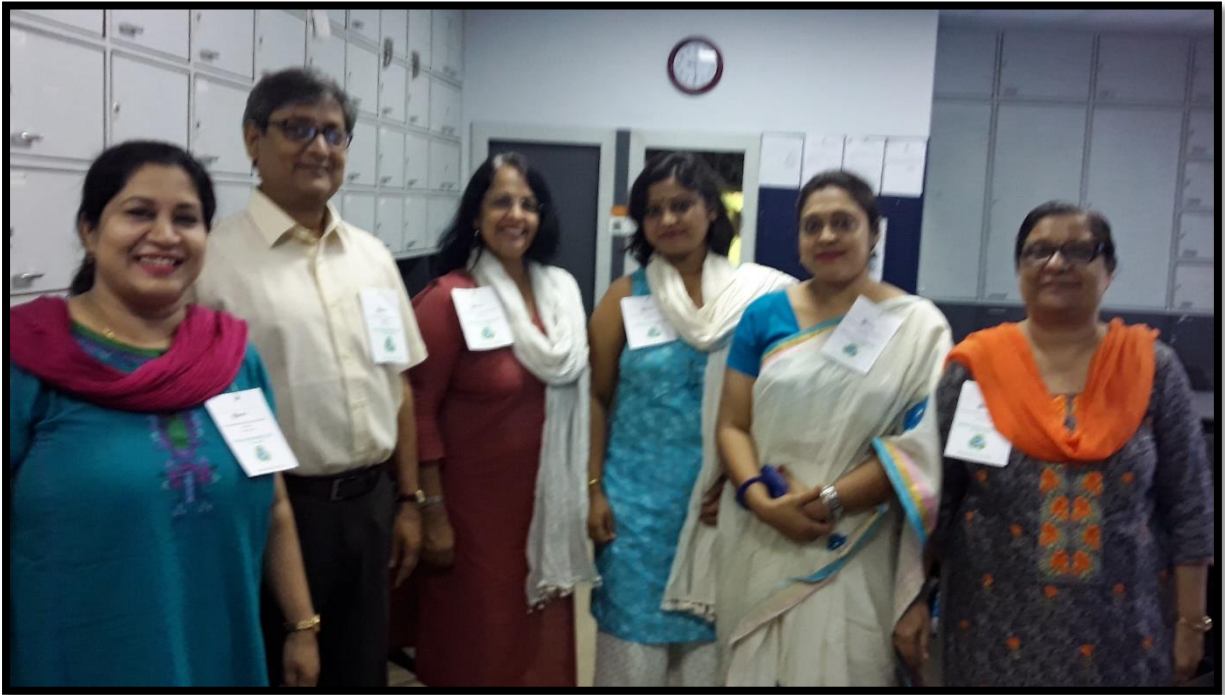
Teachers wearing the badge

endeavour to commemorate the World Environment Day was truly encouraging. Some of the moments have been captured in the following pictures.